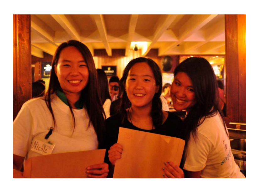
Volunteer Appreciation Party, Summer 2012

Stepping Stones and Shanghai's migrant community are indebted to all of our hundreds of volunteers who make the work we do possible.